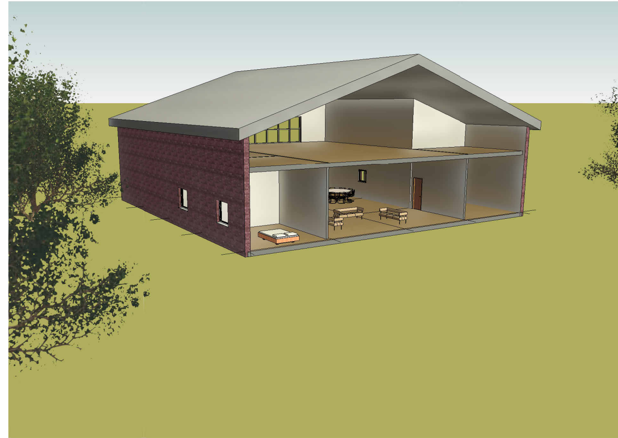
2 3D View 2